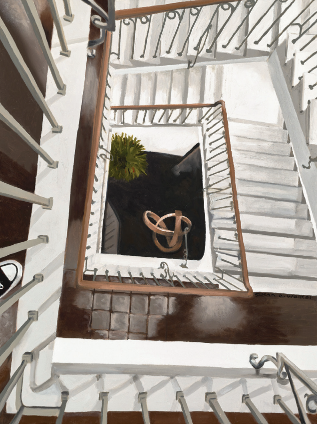
"The Black Shoe", oil on canvas, 24" x 18"