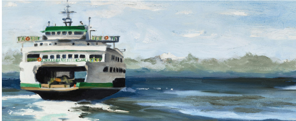
"Underway", oil on canvas, 24" x 36"